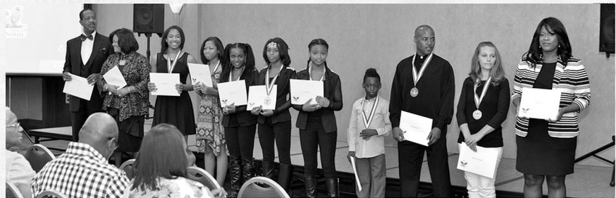
Winners of the President's Volunteer Service Awards were recognized Aug. 1.

"This year a $500 gift was awarded to I Am B.E.A.U.T.I.F.U.L., a nonprofit organization that engages girls in interactive learning experiences designed to build self-esteem and strong leadership skills."