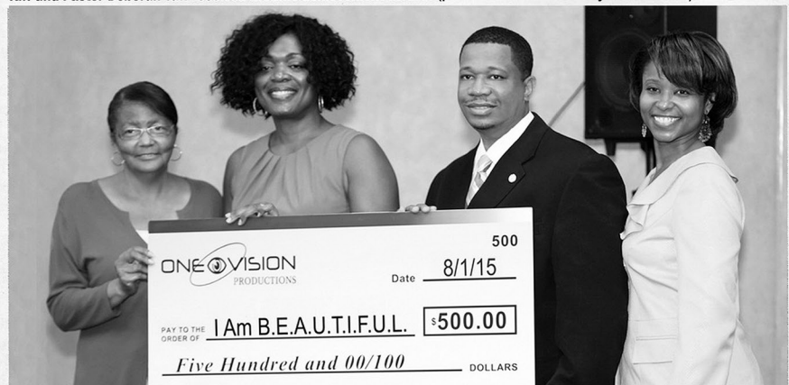
Members of the nonprofit I Am B.E.A.U.T.I.F.U.L. received the Pay It Forward Award.